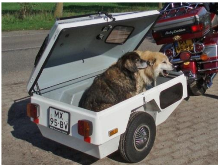
It could be an option.....

All the normal things we will skip, we'll only mention the things you likely will forget during your preparation.